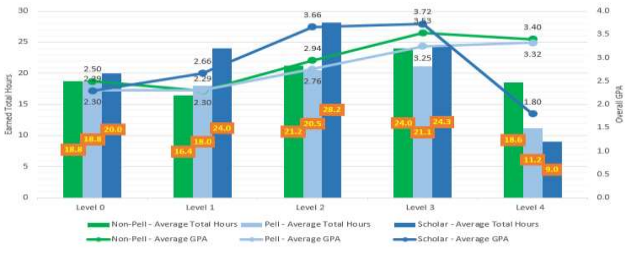
Figure 1: Earned Hours and GPA by Level

Figure 1 shows the average earned hours and yearly GPA during the 2018-19 and 2019-20 academic years by level in these three different groups. Hours in major courses and required math courses are considered to be earned if grades are C or above, while hours in other courses are earned if grades are D or above. Non-Pell eligible students tend to have better GPA across all levels than the Pell eligible group. They also tend to earn more credit hours in all levels with the exception of level 1. The largest gap is at level 4: students in the non-Pell eligible group earned about 7 more credit hours on average than in the Pell eligible group. From level 0 through level 3, Scholars earned more hours with better or similar GPAs compared to the other two groups. The gap of earned credit hours in level 1 and 2 is very impressive: in average, Scholars earned about 7 more credit hours than the other two groups. Such gap at level 3 is trivial because almost all scholars starting at level 3 in fall tend to graduate in the following spring. They have taken all the courses they need for graduation. There was only one scholar at level 4 who started in fall and took 3 computer science courses to graduate on December of the same year. Therefore, data about the single scholar at level 4 is not statistically meaningful.